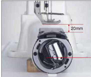
Large shuttle hook